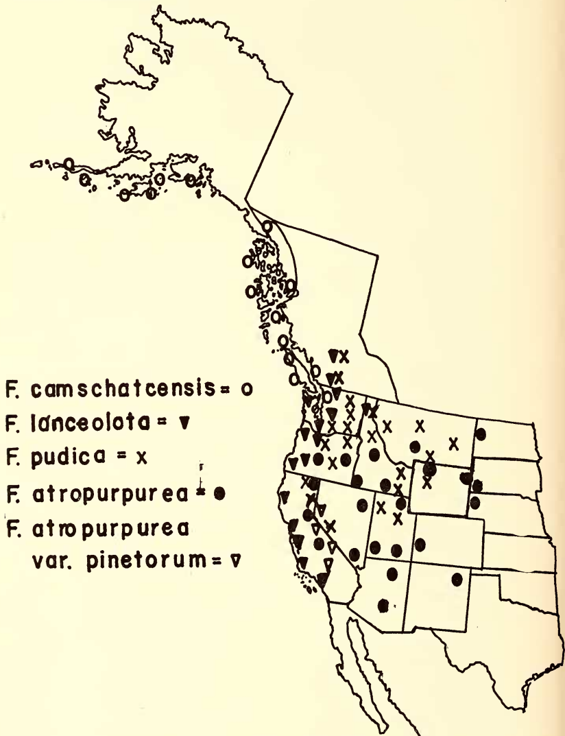
FIG. 4. Distribution of certain species of Fritillaria in Western North America.

affine Schult. Syst. Veg. 7: 400. 1829, in part. Fritillaria mutica Lindl. Bot. Reg. t. 1663. 1835. F. lanceolata var. floribunda Benth. Pl. Hartweg. 338. 1857. F. lanceolata var.? Benth. Pl.